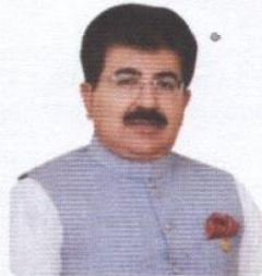
H.E. Muhammad Sadiq Sanjrani Chairman Senate of Pakistan

Overseas orders for Stamps, First Day of Issue Covers and Leaflets should be addressed to the Manager, Philatelic Bureau, Karachi GPO or Manager, National Philatelic Bureau, Islamabad GPO, accompanied by a Bank Draft or Crossed Cheque encashable in Pakistan.