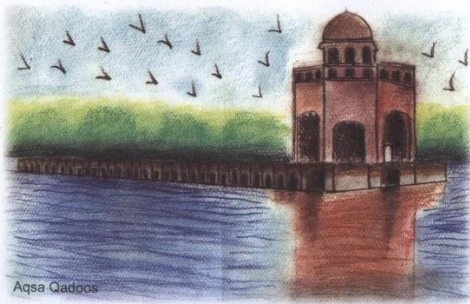
First Day Of Issue