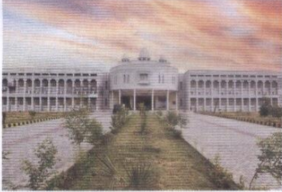
FIRST DAY OF ISSUE